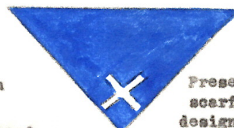
Present scarf design.

St. Andrew's has had a good record in competitions and in 1957 carried off the County Scout and Group Flags.